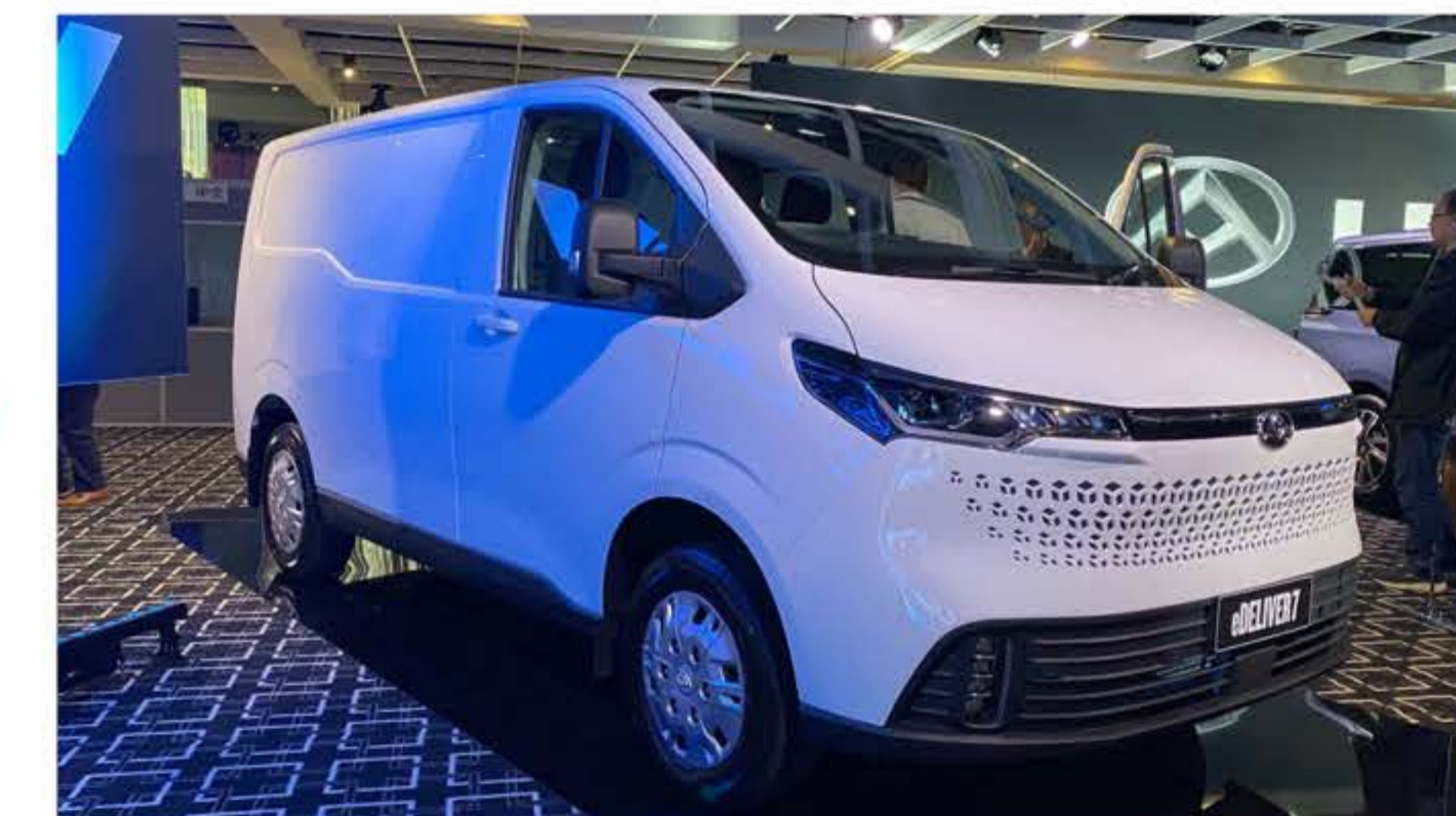
L2H1 (5364mm Max Overall Length)