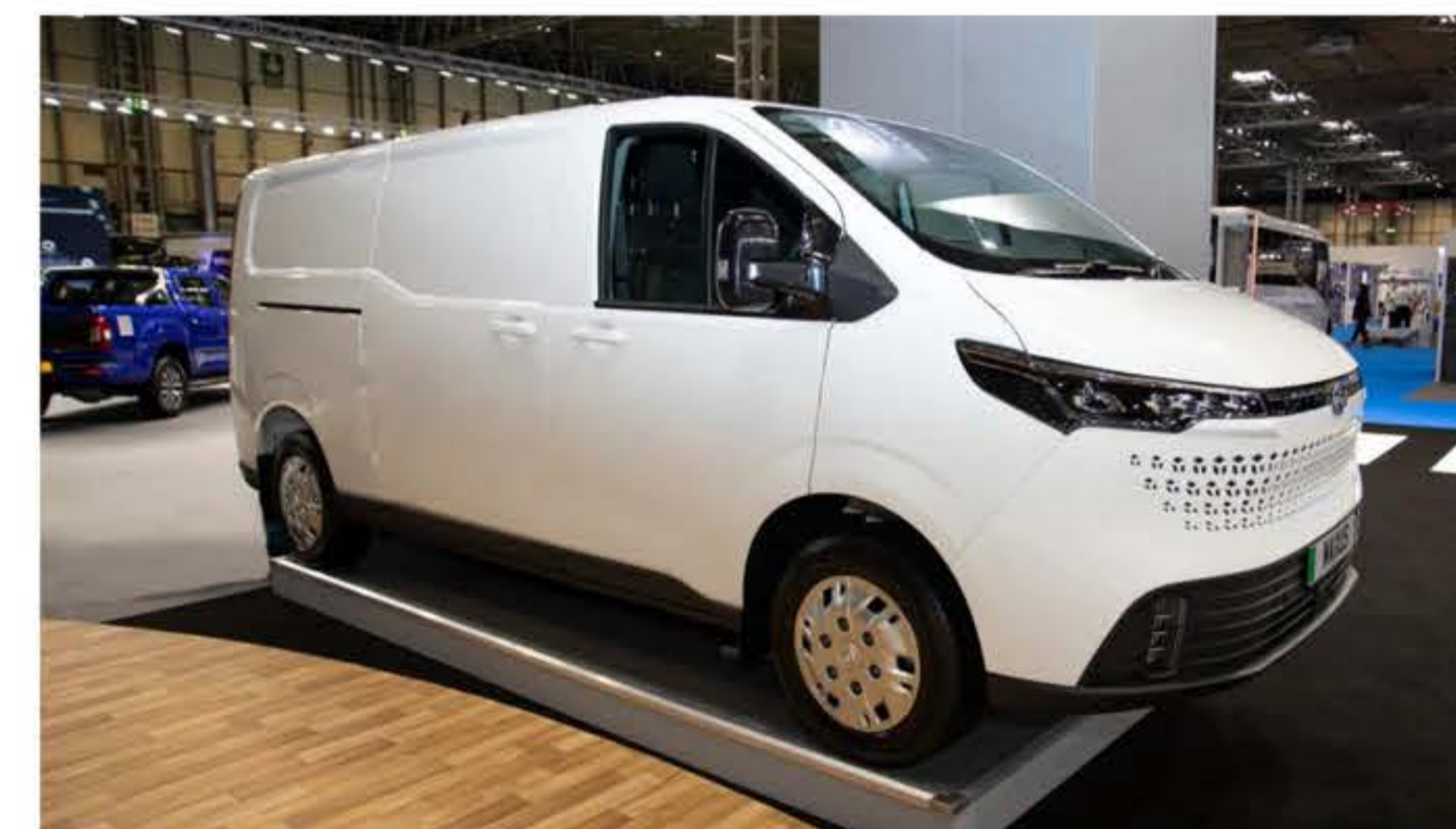
L1H1 (4998mm Overall Length)